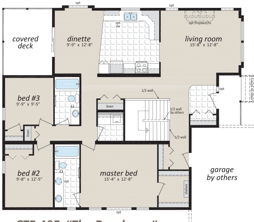
CTF-405 "The Roseberry" 40'6" x 38'/43'6"/38' - 1,809 Sq. Ft.