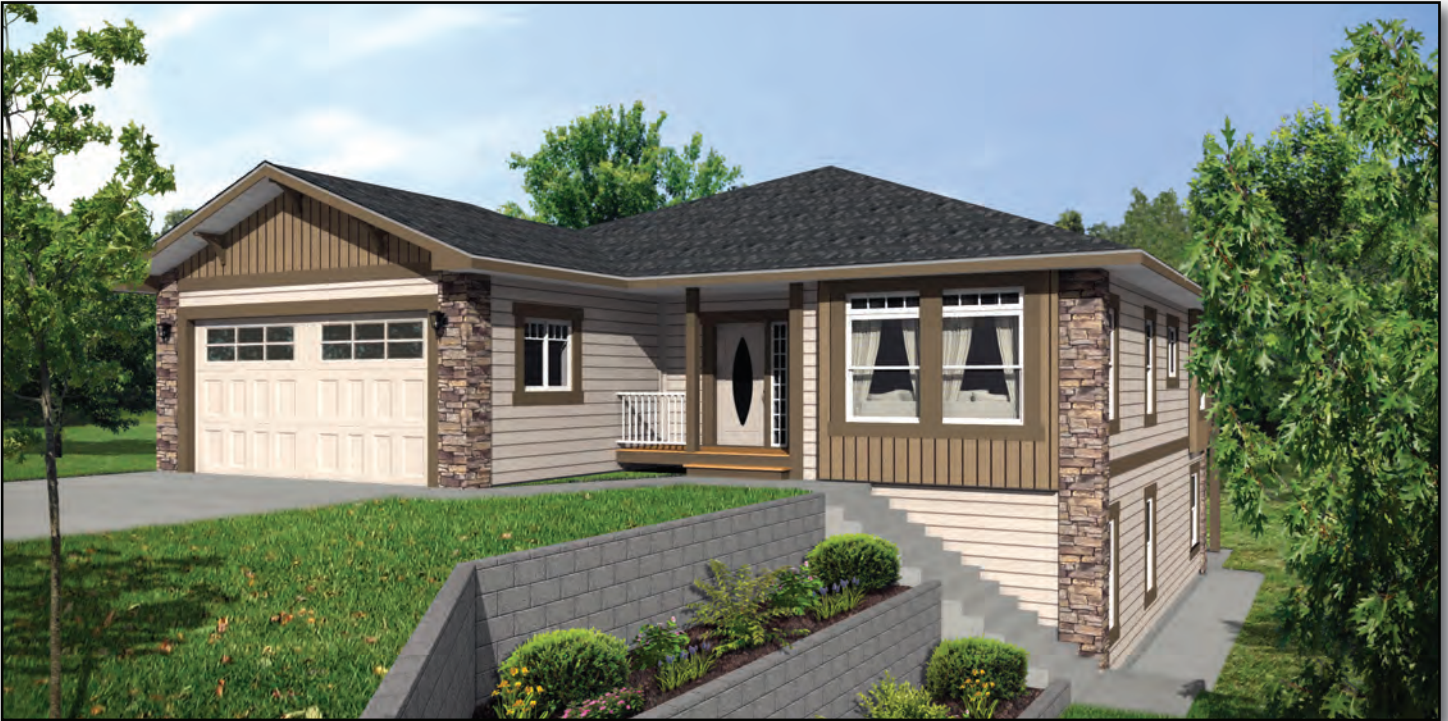
CTF-405 "The Roseberry" 40'6" x 38'/43'6"/38' - 1,809 Sq. Ft.

Artist Renderings Optional Deluxe Exterior Shown Some features shown may be optional